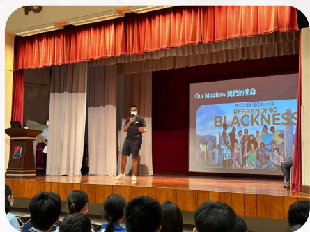
Representatives from African Centre Hong Kong sharing with our students their unique culture