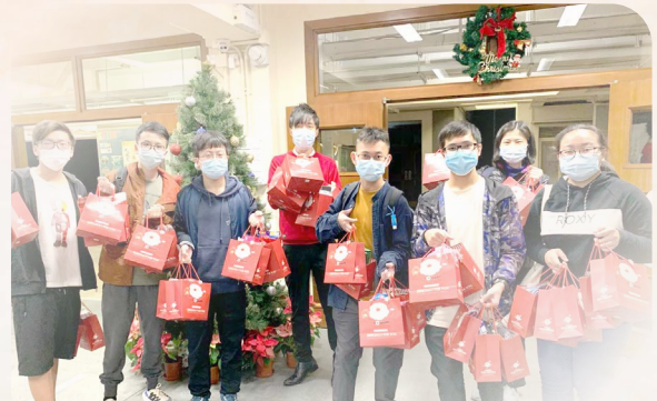
Visiting the homeless at Christmas