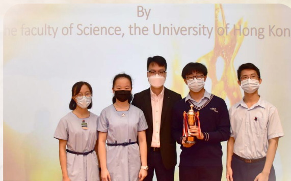
Our students were the second runner-up in the Inter-school Online Science Competition 2021.