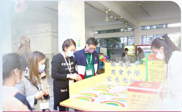
PTA Game Stall on Admission Information Day