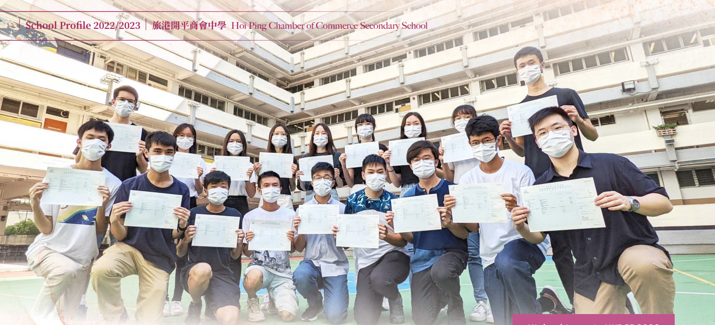
High achievers in HKDSE 2022