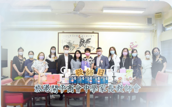
PTA preparing presents for teachers on Teachers' Day

Students' personal growth relies on the mutual efforts of the school and parents. For this reason, Parent Teacher Association dedicates its resources to providing a wide array of events, such as Teachers' Day, PTA Outing, School Uniform Recycling Programme, S1 Parents' Sharing Day, Nagomi Pastel Art Workshop and Arty Gardening Workshop.