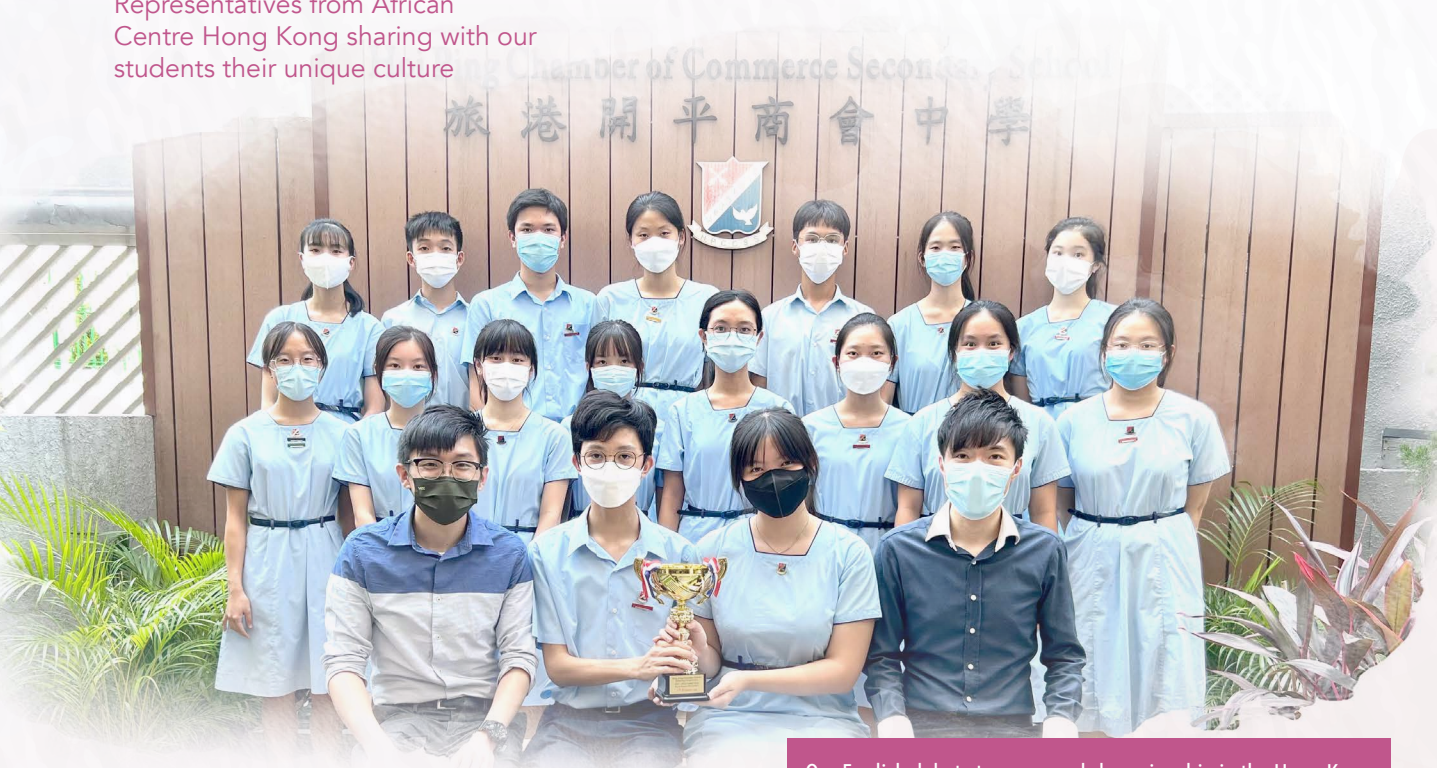
Our English debate team earned championship in the Hong Kong Secondary Schools Debating Competition 2021-2022.