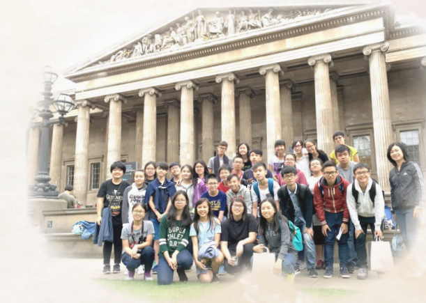
London Cultural Study Tour