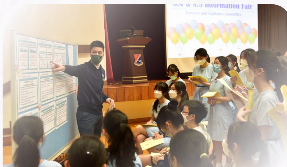
S4 - S5 Information Fair