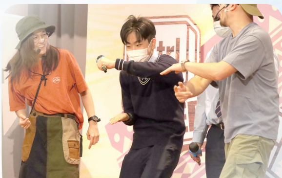
ICAC Interactive Drama

Our school highly values the moral development of students. Values including responsibility, kindness, integrity, diligence, gratitude and positive thinking are integrated into the school curriculum through activities such as S3 Mock Election, sharing sessions, talks, workshops, drama activities, competitions, and so on.