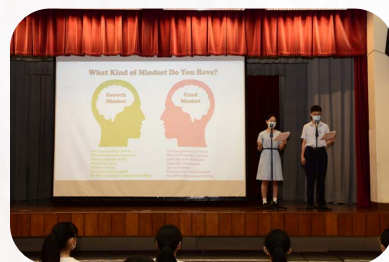
Our students conducting a presentation during the morning assembly

Our school believes that the mastery of English, Chinese and Putonghua is crucial for students to cope with the challenges they may face in the era of globalisation. Hence, we seek to create an environment that is conducive to the acquisition of these three languages.