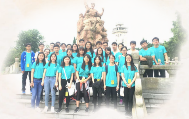
Hoi Ping Study Tour

Various study tours are organised to encourage students to go beyond the confines of Hong Kong to widen their horizons and to expand their global views.