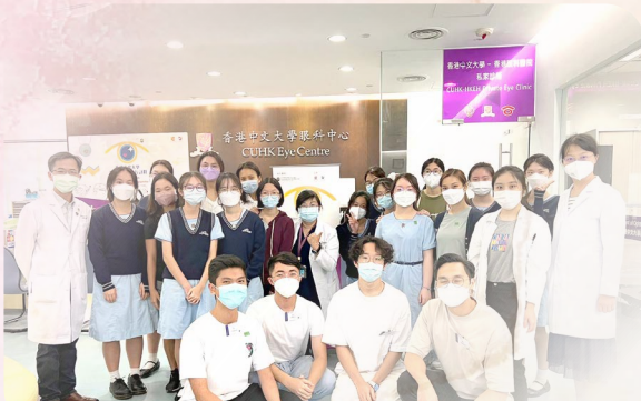
Volunteering under the CUHK Jockey Club Children Eye Care Programme