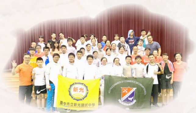
Taichung Fencing Training Tour