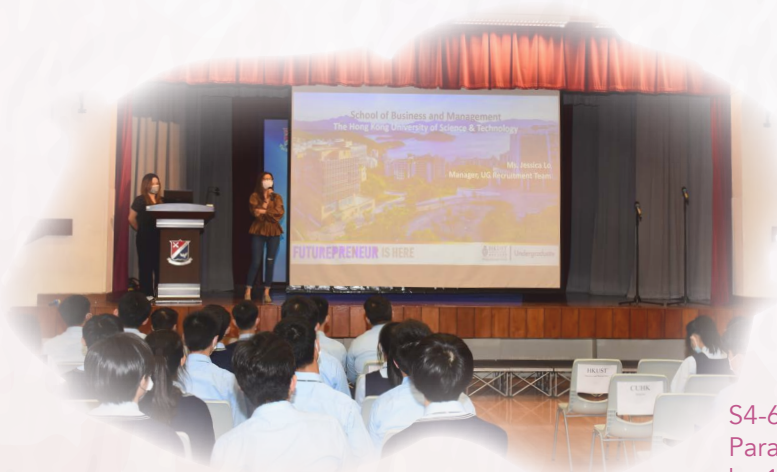
S4-6 Admission Information Parallel Sessions conducted by 11 tertiary institutions