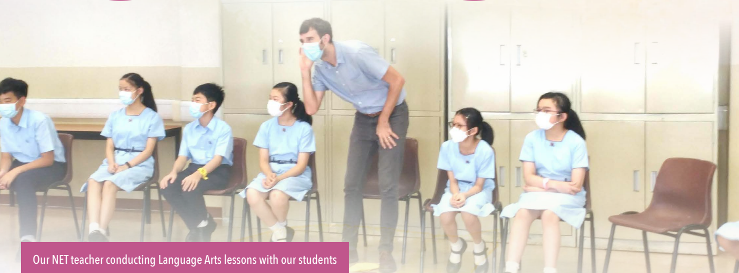
Our NET teacher conducting Language Arts lessons with our students