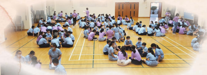
Peer Tutor Scheme