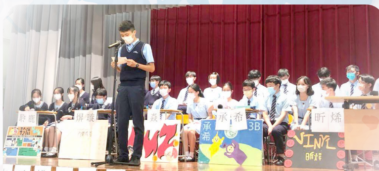
S3 Mock Election