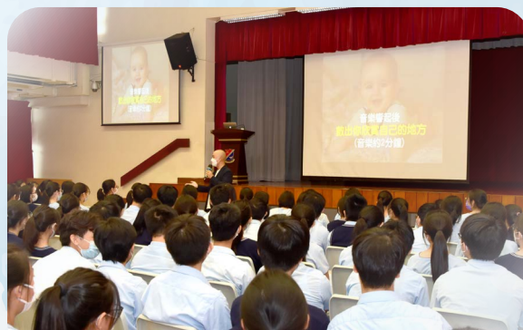
Talk on the Power of Gratitude