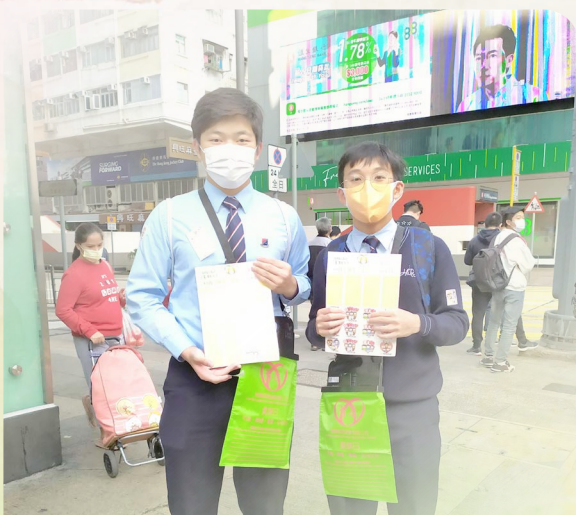
Flag selling day