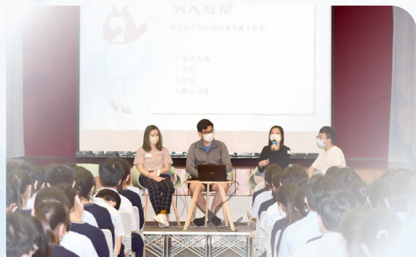
Alumni sharing their valuable work experience with current students