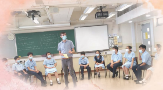
S1 Bridging Programme

We provide a series of programmes to help S1 students adapt to the secondary school life. Remedial classes are also offered for the three core subjects to ensure a good foundation for their education.