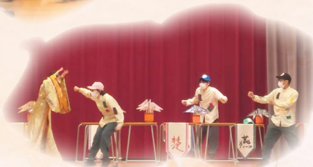
賽馬會「戲說文言」 文言文戲劇教育計劃 - 劇目：《六國論》