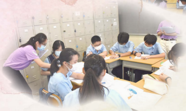
S1 Study Group