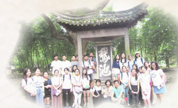
Hangzhou Shaoxing Literary Walking Tour