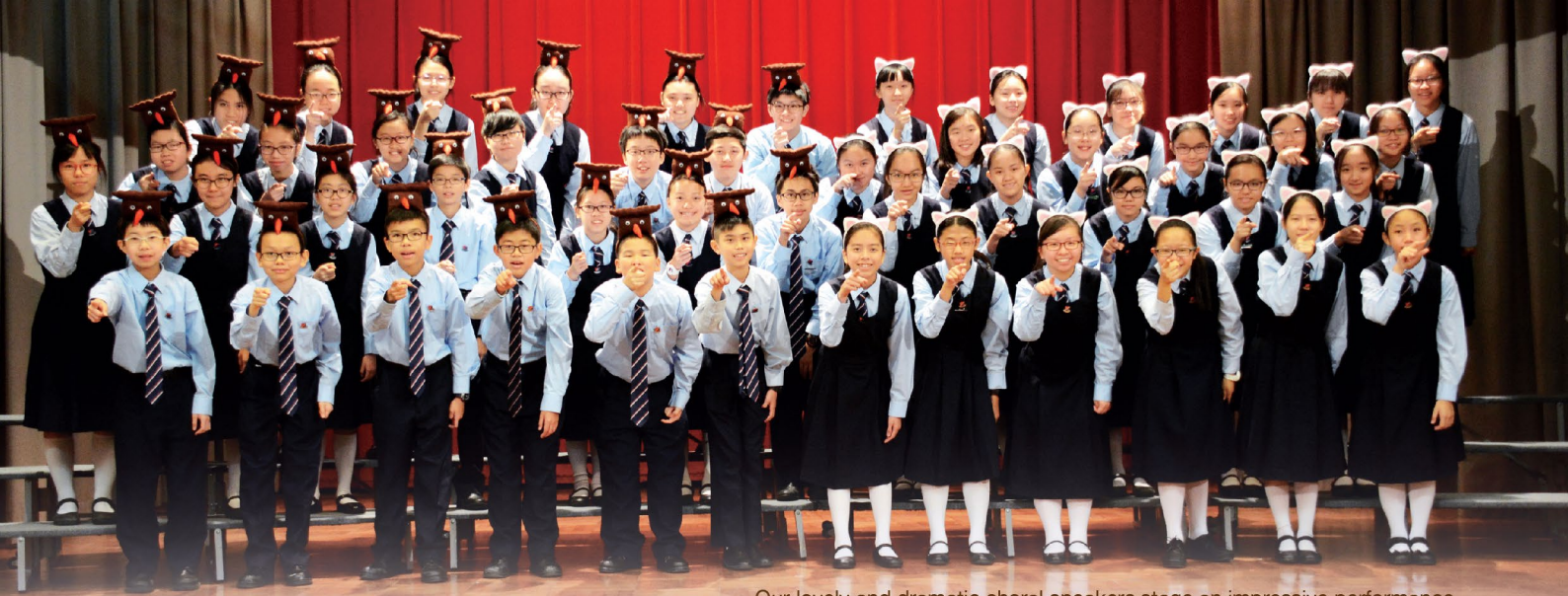
Our lovely and dramatic choral speakers stage an impressive performance.