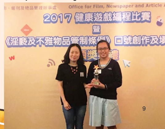
Second runner-up in Healthy Game Coding Contest