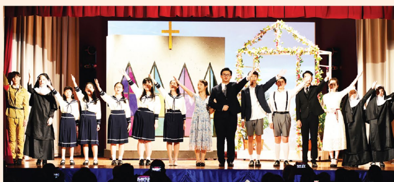
Student actors and backstage members of the musical attend countless after-school rehearsals—just to perfect their roles to delivery this stellar performance!

The highlight of the Variety Show was definitely the English musical – “The Sound of Music”. Our students spent months preparing for the musical and their wonderful performance showed that their efforts had paid off. There were spectacular visual elements in the musical, and together with actors' singing and dancing, it was the perfect show to wrap up the perfect night. The audience were evidently satisfied with the performances as thunderous applause resounded in the hall at the end of the Variety Show!