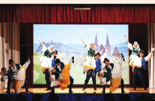
The Alumni Dance Team's performance is a sight to behold!

Next, the English Choral Speaking Team captivated the entire hall with their lively and energetic performance. The western dance performed by the Alumni Dance Team donning beautiful costumes was equally amazing! But the climax was teachers' performance—the crowd roared in absolute joy as everyone was deeply impressed by our teachers, who shed their usual authoritative image as they sang and danced on stage!