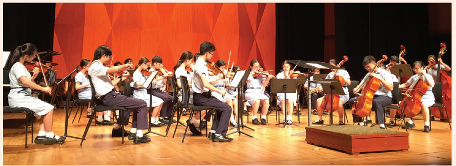
Our talented musicians score spectacular success in music competitions.

Our school's Orchestra participated in the Joint School Music Competition, String Orchestra and Symphony Orchestra. Students played a medley from "Pirates of Caribbean" with a percussive, spirited mood, and a lively famous music piece, Hungarian Dance No.5 by Brahms. They were awarded the Silver Prize and praised for their good cooperation and balance of different parts.