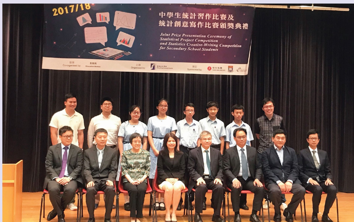
Our young statisticians displaying excellence in a statistical project competition.

Having learnt to manipulate data and collaborate closely with teammates, our S4 team won the Second Prize of the Senior Section with their research project entitled 'LEFT-OVER WOMEN - A Revisionist Analysis of Its Causes'. Meanwhile, our S3 team was awarded the Distinguished Prize of the Junior Section with their project 'More and more DSE survivors dropping out of university - What is going on?'