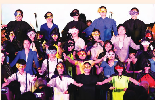
The School Choir express their love for the school through lyrics—and fashion!