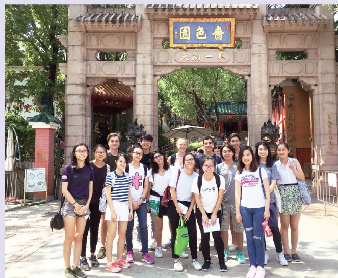
The hot July weather hardly dampens the mood of this merry group!

On their own initiative, eight S4 and S5 students acted as tour guides to visitors from the University of Edinburgh. The visitors were brought to famous tourist spots like Wong Tai Sin Temple, Mei Ho House and Garden Hill. Not only did students enhance their career-related knowledge, but they also had their horizons broadened through the cultural and academic exchange with the visitors. All of them had an enjoyable and fruitful day.