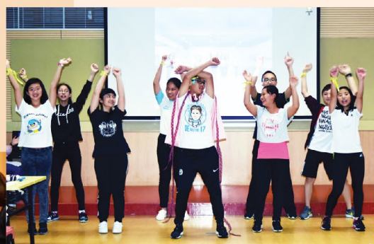
S1 Growth Camp