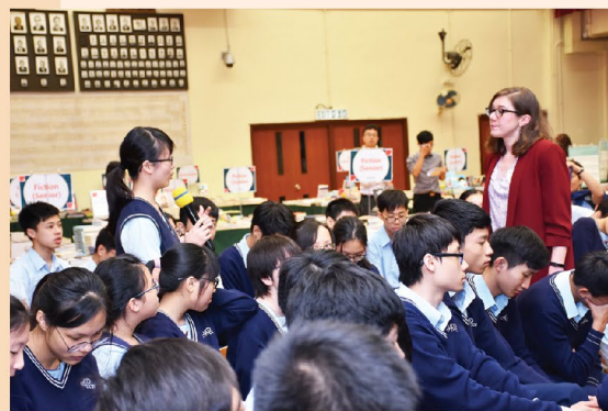
English Writer Talk