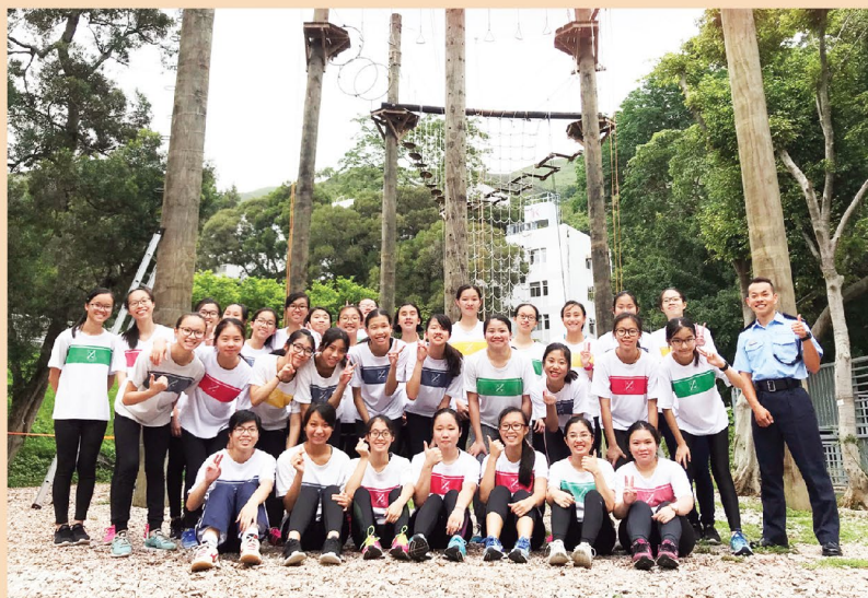
Girls Athletics Training Camp