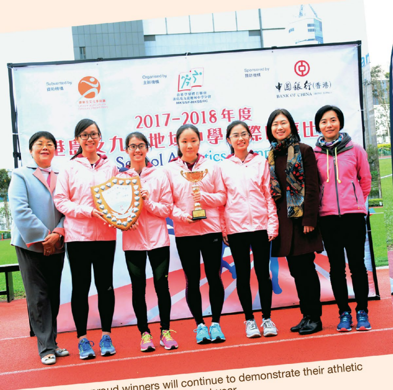
These proud winners will continue to demonstrate their athletic prowess in the top division next year.