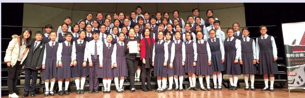
Choir members grinning proudly after their enchanting performance.

Our School Choir made an excellent achievement this year. They participated in the Junior Mixed Choir, foreign language section of the 70 th Hong Kong Schools Music Festival and came third. Also, they were awarded the Gold Prize in the Joint School Music Competition – Challenger Section. Our choir members performed two pieces, "Thank you for the Dream" and "TurotEszik a Cigany". Adjudicators praised the team for their full, strong tone, and expressive musical phrasing. Their good articulation and contrasting dynamics fit well together.