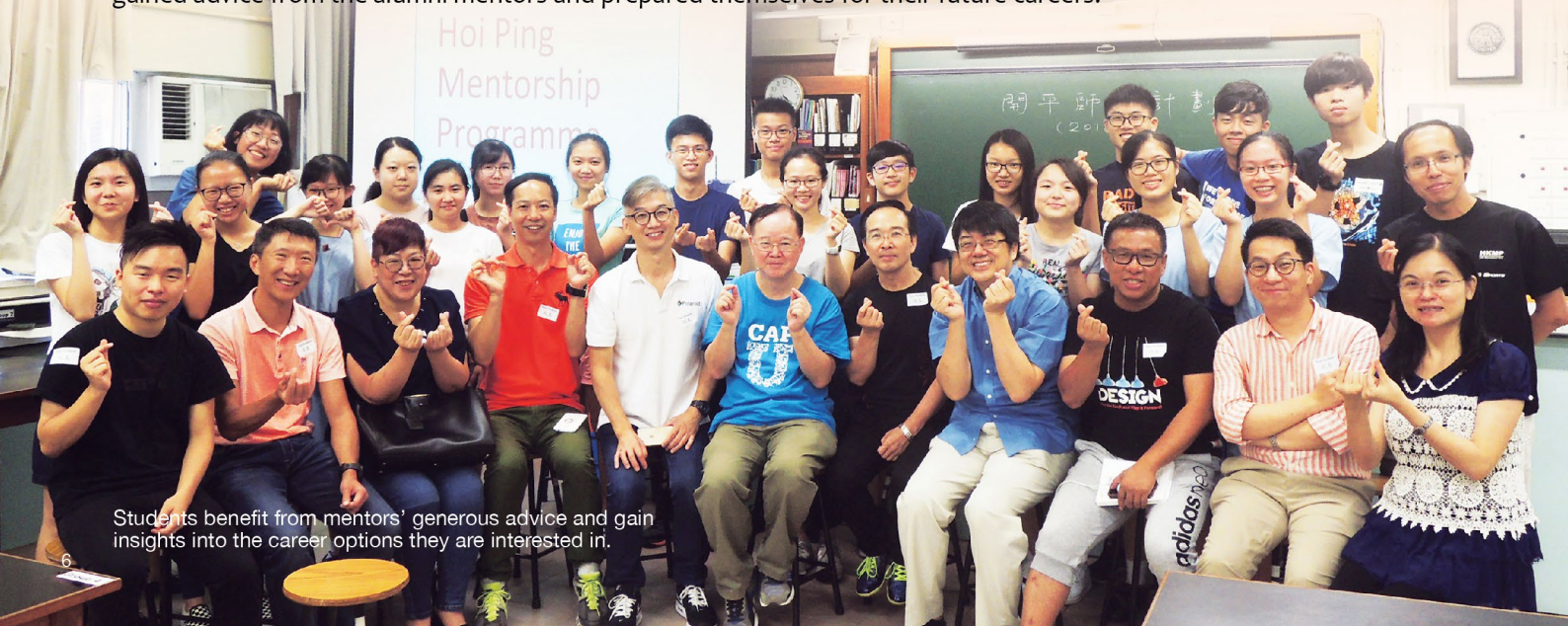
Students benefit from mentors' generous advice and gain insights into the career options they are interested in.

The Careers and Guidance Committee aims at helping students set life goals and enriching their knowledge of the world of work. Together with the Alumni Association, the Hoi Ping Alumni Mentorship Programme was thus launched in July 2018. 22 S4 and S5 students were among the first group of mentees of the programme. They were put into small groups based on their preferred industries. Each group was led by one to two alumni mentors from different fields of work such as medicine, physiotherapy, nursing, architecture, business, finance, engineering, and design. In these informal meetings, students gained advice from the alumni mentors and prepared themselves for their future careers.