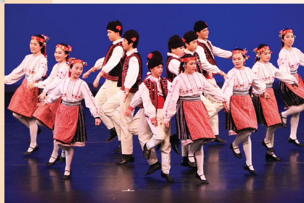
Honours Award and Choreography Award in 54 th Schools Dance Festival