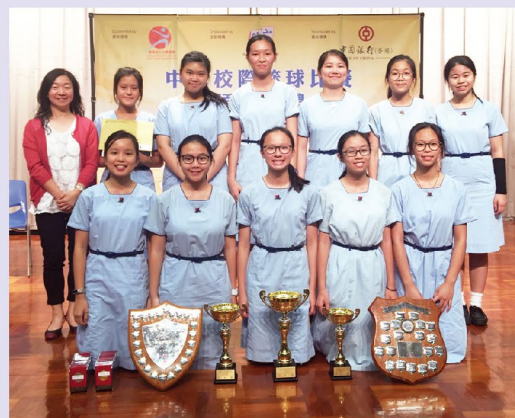
It was through months of intensive training that the girls succeeded in achieving this encouraging result.

Winning is not always because of luck. To achieve that one goal, every team member must work together as one to establish a sense of pride, trust and belongingness. As a school committed to nurturing students' all-round development, we are very proud of everyone's pursuit of perfection in the games.