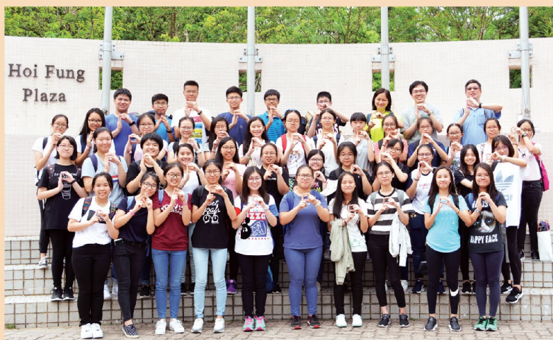
Peer Tutor Camp