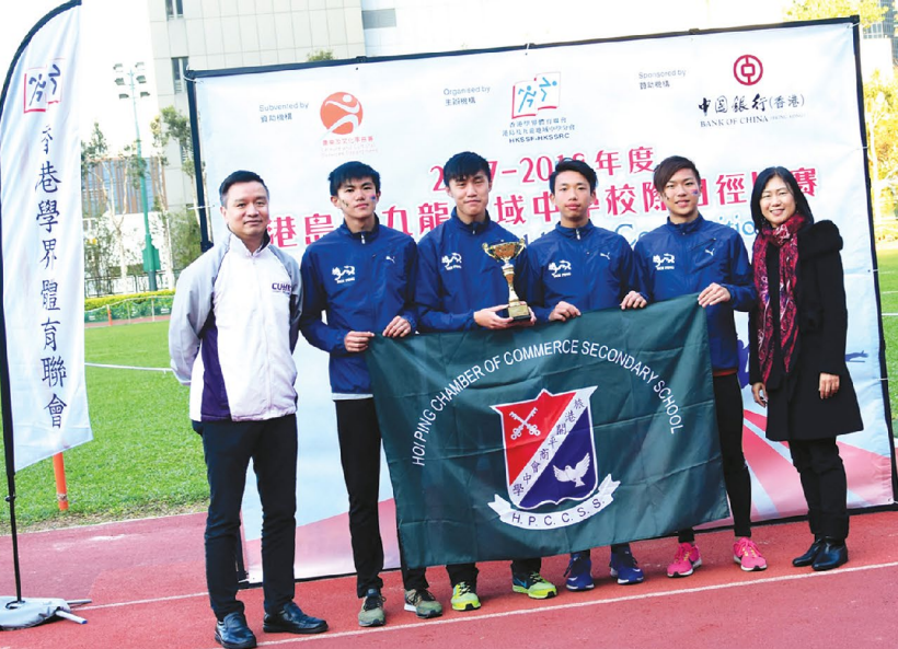
This is a picture-perfect moment of glory on the Wan Chai Sports Ground, a witness to many of our Athletics Team's victories.