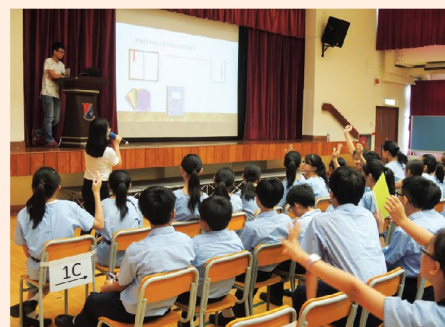
S1 Effective Learning Talk