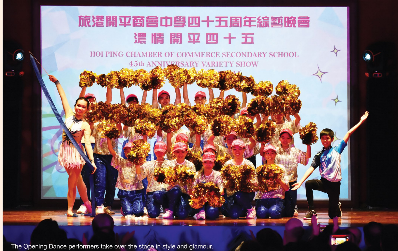
The Opening Dance performers take over the stage in style and glamour.