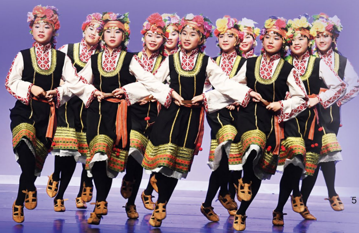
Dancers in traditional folk costumes performing to the best of their ability on stage.