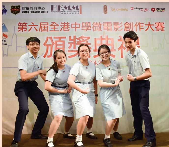
Our students won a trip to Beijing with their award-winning mini-movie.