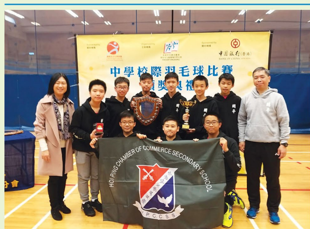
The newly crowned champions will face greater challenges next year in Division 1—and they're ready!

We will keep striving for perfection with all our might!