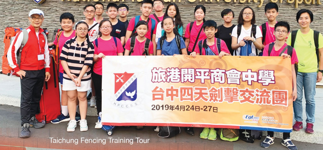
Taichung Fencing Training Tour

國立臺灣體育運動大學 National Taiwan University of Sport