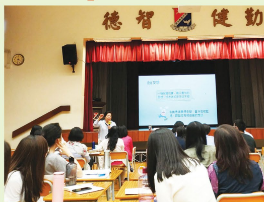
An expert speaker has been invited to deliver a talk on understanding and helping students with mental health issues.

These measures will enhance the capacity of the school as teachers are the key to success in school development.