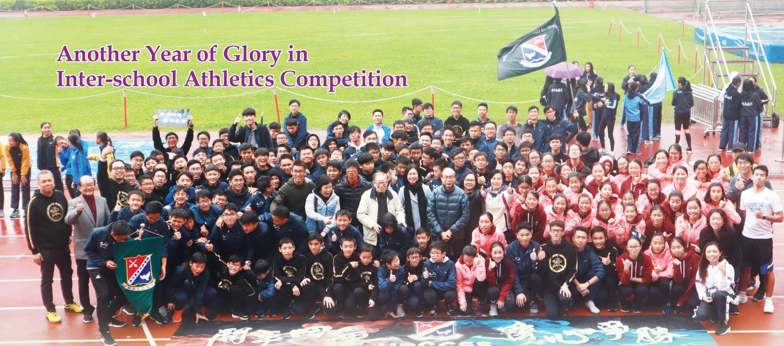
The Boys' Athletics Team's yearly tour-de-force has been applauded and widely recognised.

After three days of intense competition, our Boys' Athletics Team once again accomplished the remarkable feat of achieving third place in this year's Inter-School Athletics Competition.