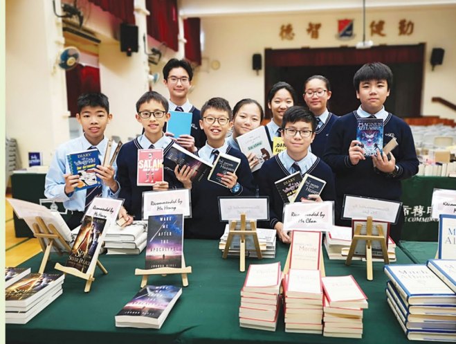
Students are eager to own a copy of their favourite books!