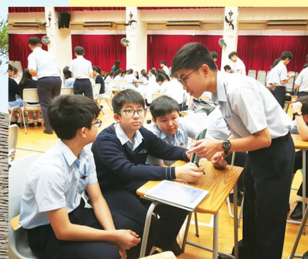
Mathematics Fun Day