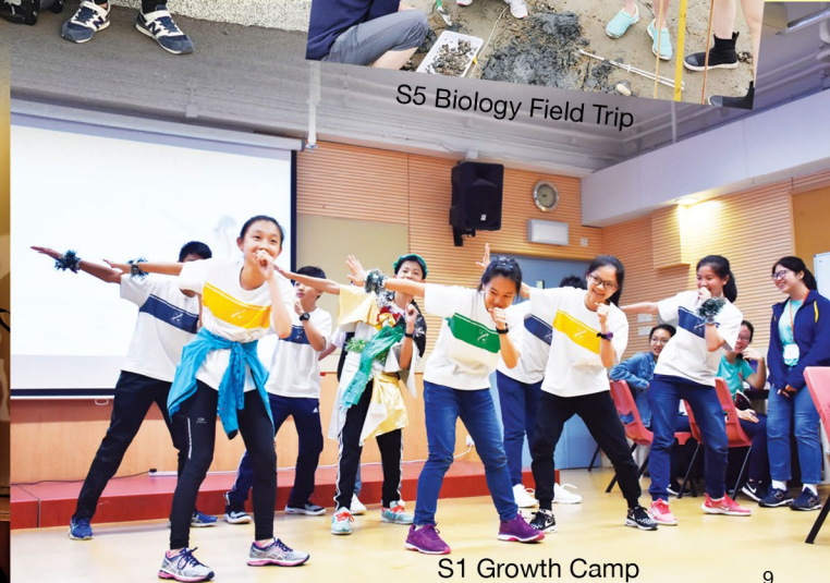
S1 Growth Camp