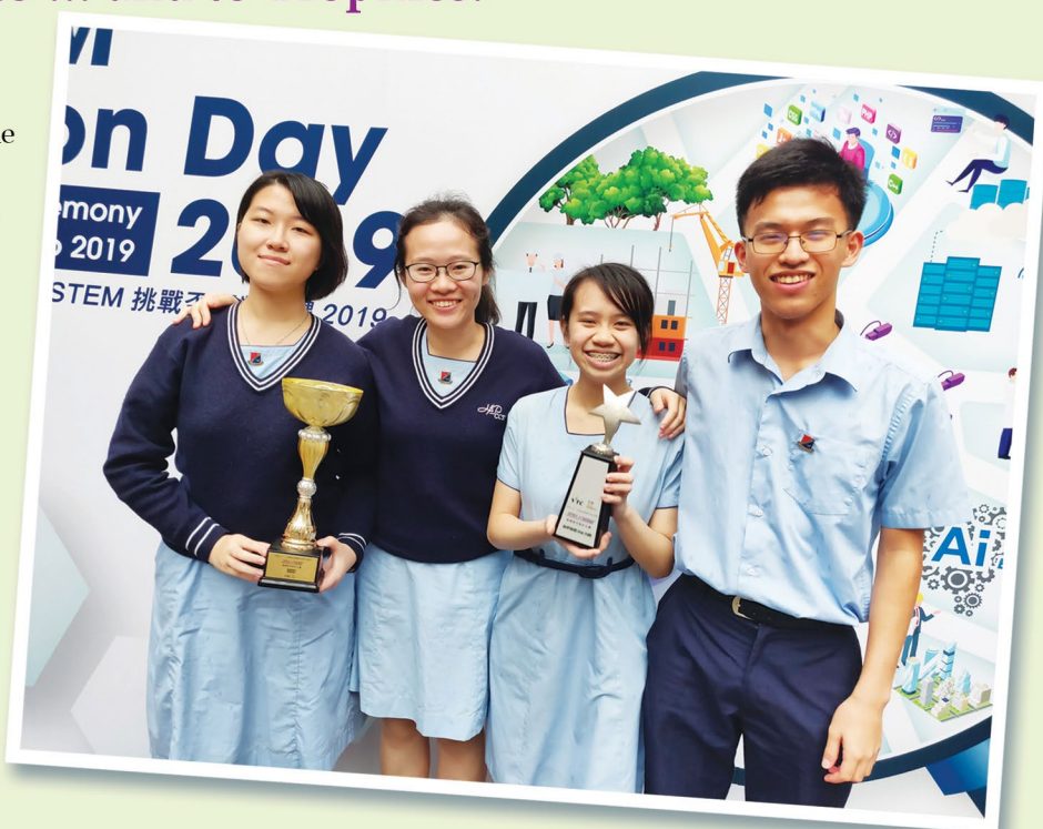
Our team impressed judges and Netizens with their cleverly designed game.

On 15 th May 2019, four S5 students participated in the VTC STEM Challenge Cup 2019, a computer game design competition. Our students had to design a game geared towards promoting STEM to the public and encouraging girls to work in STEM-related industries, and with their commendable dedication, they walked away with the First Runner-up medal and the Award for the Most Popular Game on the Internet. Congratulations!