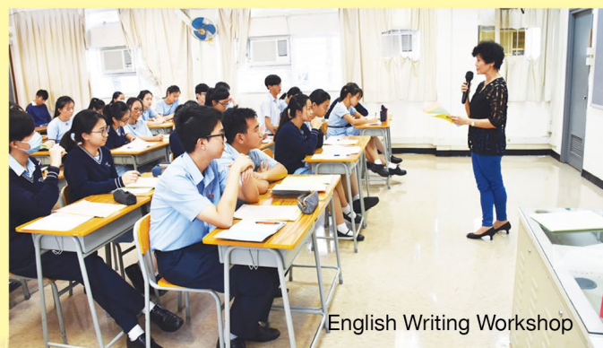
English Writing Workshop