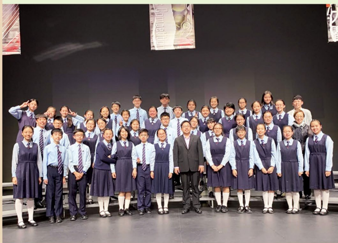
Our choristers impressed the judge with their angelic voices.

Our school choir participated in the Joint School Music Competition 2019 (Mixed Choir) organised by Hong Kong Joint School Music Association in April this year. With their phenomenal performance of the song 'Remember Me', they were awarded the Gold prize with a high score of 90. Congratulations to the school choir!