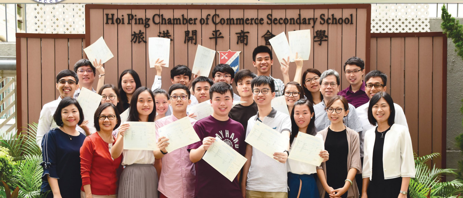
High Flyers in HKDSE