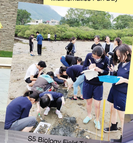
S5 Biology Field Trip