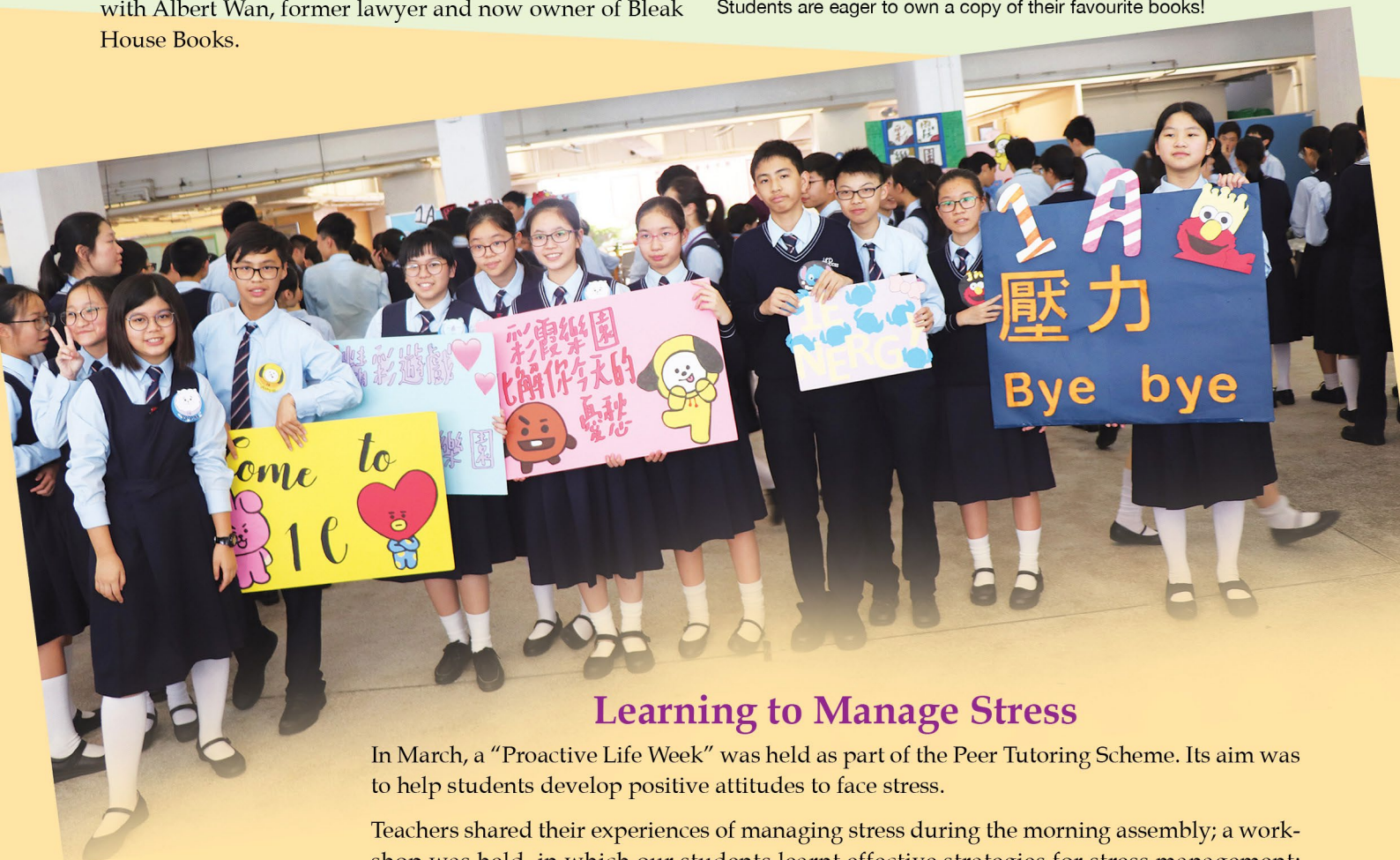
Organising game stalls? For these brilliant S1 students, this is no pressure!