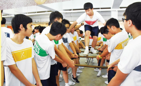
S2 Adventure Day