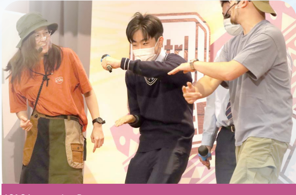
ICAC Interactive Drama

Our school highly values the moral development of students. Values including responsibility, kindness, integrity, diligence, gratitude and positive thinking are integrated into the school curriculum through activities such as S3 Mock Election, sharing sessions, talks, workshops, drama activities, competitions, and so on.