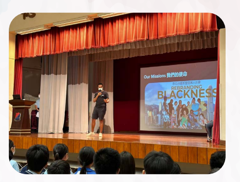
Representatives from African Centre Hong Kong sharing with our students their unique culture