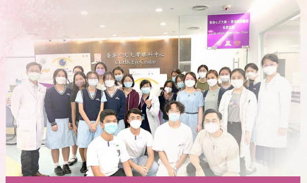
Volunteering under the CUHK Jockey Club Children Eye Care Programme