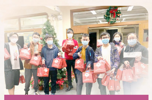
Visiting the homeless at Christmas