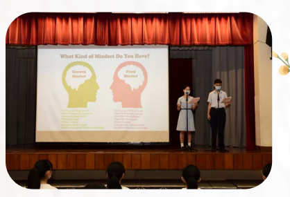
Our students conducting a presentation during the morning assembly

Our school believes that the mastery of English, Chinese and Putonghua is crucial for students to cope with the challenges they may face in the era of globalisation. Hence, we seek to create an environment that is conducive to the acquisition of these three languages.