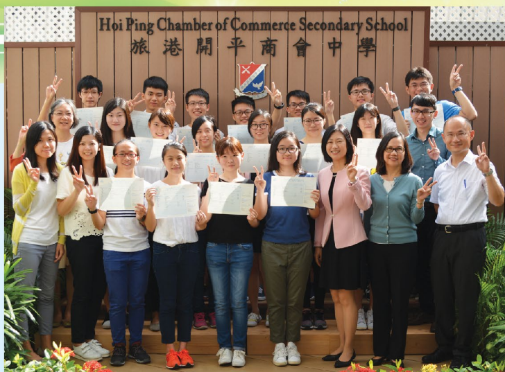
High flyers in HKDSE