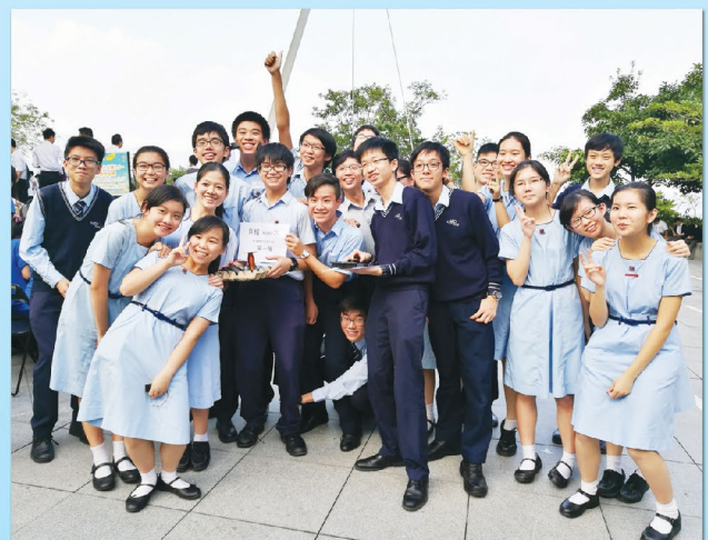
Our young talents beaming with pleasure after winning the competition.

Our school sent three teams to participate in Vibrating Robot Race 3.0 organised by the Hong Kong New Generation Cultural Association on 5th November 2016. In this competition, each participating team had to make their own robot for an obstacle relay race. After countless attempts of trial and error, our students overcame all obstacles and were ready to face the challenge. With their collaborative efforts, one team was awarded the First Class Honour and the other two teams were awarded the second prize!