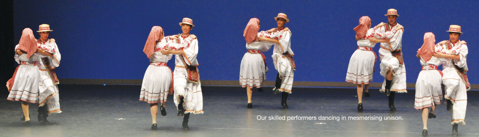
Our skilled performers dancing in mesmerising unison.