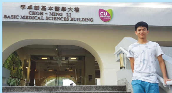
Cheung Ching To is studying Medicine in CUHK.

Since I joined quite a number of activities, it is important for me to arrange my time well. To me, homework is never a chore but an opportunity to learn more. In order to consolidate my language skills, I will read classic Chinese texts and do extra writing practices. I will also look for mock exam papers online to test myself so as to build a solid foundation.