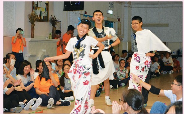
Students are doing a catwalk for the talent show.

To help students develop a stronger sense of belonging to the school and their classes, the Counselling Committee organised the S1 Growth Camp on 5th and 6th May 2017. Through completing different challenging command tasks prepared by our peer tutors, our S1 students unleashed their creativity in writing lyrics and designing costumes for the talent show. The sharing session also helped them learn how to appreciate themselves and the others. The camp was full of laughter and helped a lot in cultivating a harmonious and supportive atmosphere among students.