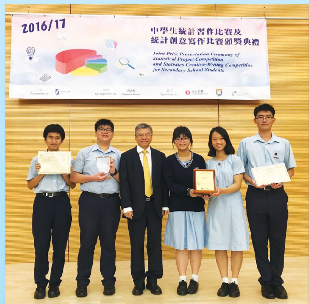
Students capturing this glorifying moment with the adjudicator.

Our students learn to manipulate data and to cooperate closely with their peers. Eventually, the research project of the S4 team, 'Basic Education: Investment or Consumption?', won the Distinguished Prize of the senior section; whereas the project of the S3 team, entitled 'Environmental Protection: Wastes, No Way', won the Prize for the Best Graphical Presentation of Statistics of the junior section.