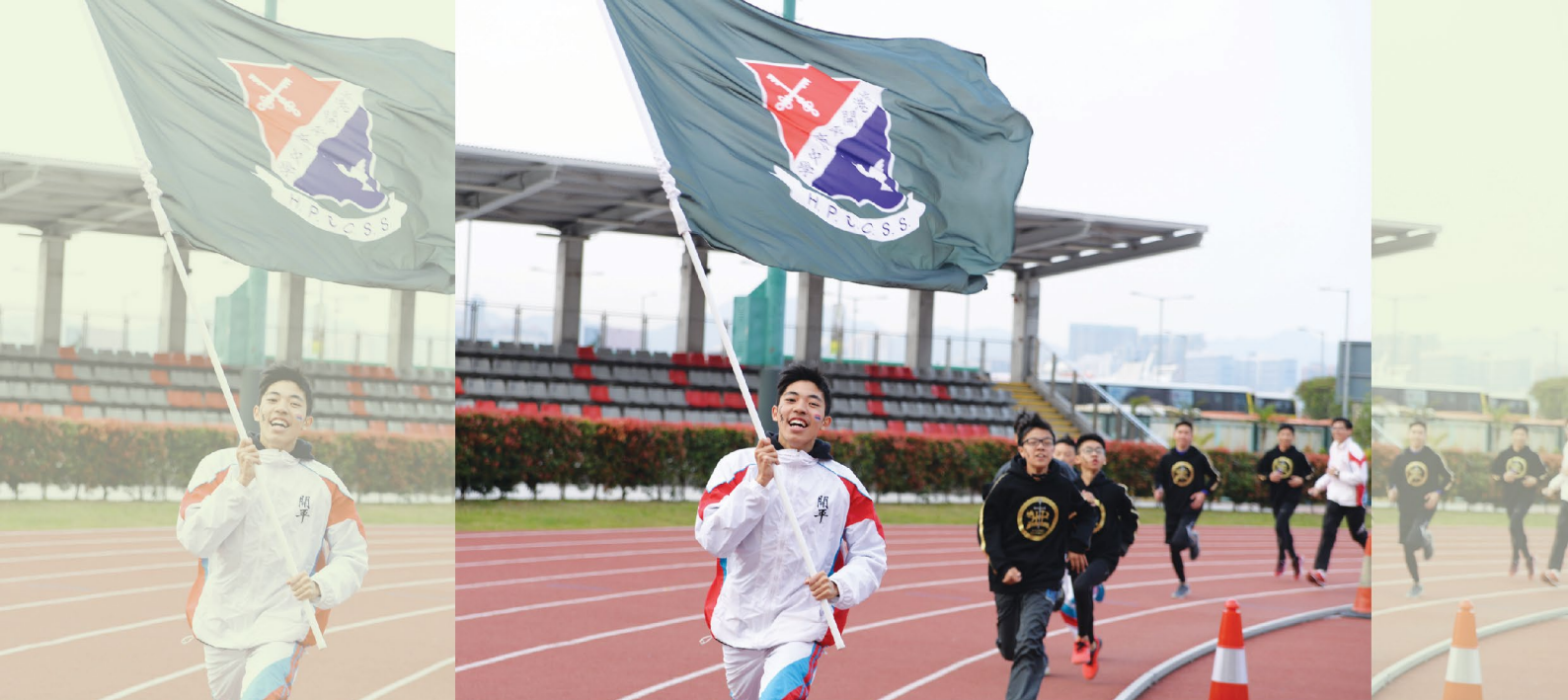
The team is running around the field in victory.