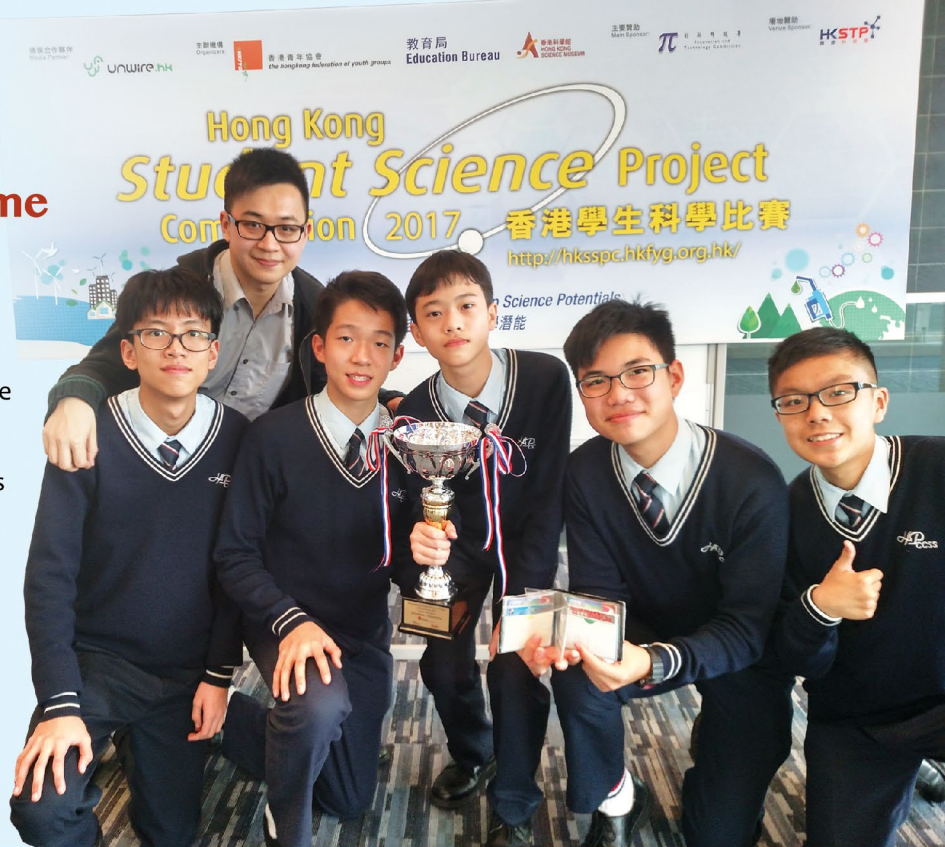
The winning team proudly displaying their design and trophy.

During summer vacation, the team represented Hong Kong and went on an exchange tour in Japan! Congratulations to our little scientists!