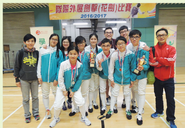
The winning team posing cheerfully when they receive their trophy.

The Outreach Coaching Fencing (Foil) Team Competition 2016/17 was held on 18th December 2016 at Hong Kong Park Sports Centre. On the day of the tournament, both our boys' and girls' teams competed with strong determination against top-class fencers. They did their best and demonstrated remarkable talent in fencing. Collaborated as a team and adjusting their strategies and rhythm, our boys' team came third in the Boys Senior Group while the girls' team was awarded second in the Girls' Senior Group.