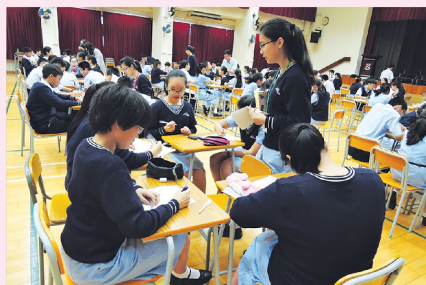
Our peer tutor is tutoring some S1 students patiently.

S1 study group sessions were held in the school hall for students from 17th to 20th October 2016 during lunch-time to assist them to prepare for their first term test. Our peer tutors were responsible for helping and teaching S1 students in the study groups. This provided a great chance for all peer tutors to share their learning experiences with our new Hoipingers.