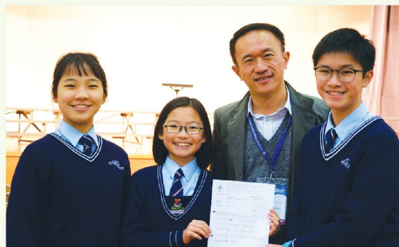
The new blood in the team grinning triumphantly with pride.

Our school choir was crowned the 1st runner-up in the Junior Mixed Choir Chinese Language Section of the 69th Hong Kong Schools Music festival on 8th March 2017. Our choir members performed two songs. The set piece, 'Where are you, Mom?' was lyrical and expressive, whereas the second song 'Dong Dong Wa' was lively and energetic. Every member performed their best and sang well on stage with confidence and full engagement. The performance was applauded by the adjudicator and audience. Congratulations to all the choir members!