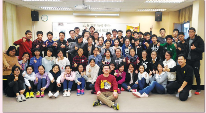
Serving others prepare us to lead others!

To strengthen prefects' sense of belonging and boost their courage and confidence in coping with problems, the Discipline Committee organised the Prefects' Leadership Training Day Camp on 25th February 2017 jointly with the Salvation Army. All 51 prefects and 3 teacher advisors joined the camp. Through a series of challenging tasks, students learned how to handle difficult situations during their tenure.