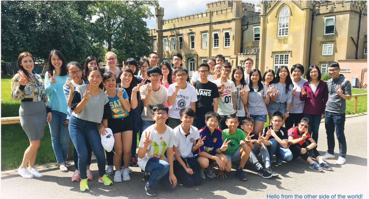
Hello from the other side of the world!