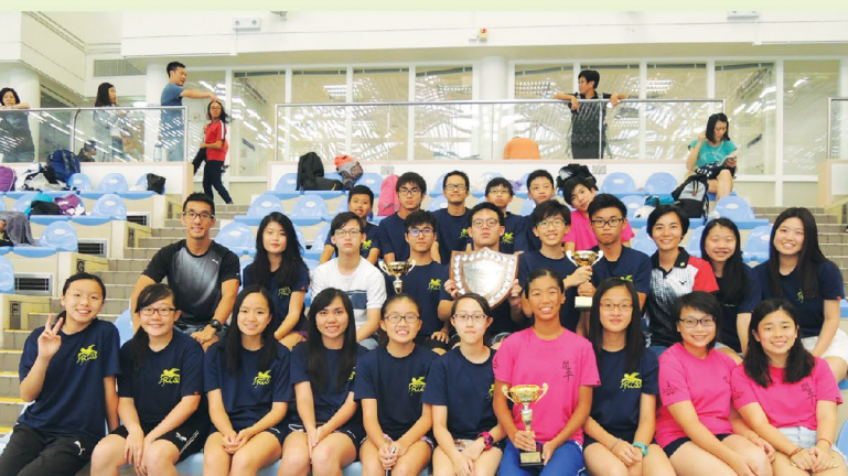
The young athletes truly enjoy the fruits of their labour!

Our school's swimming team participated in the Inter-school Swimming Competition 2016/17 on 14th October 2016 and captured a total of 11 medals in individual events and 3 medals in relays. Our students practised hard for the competition and worked closely as a team. Despite fierce competitions, they did their best and showed marvelous talents in swimming. Our students eventually won the championship for boys A grade, the second place for girls C grade and the fourth place for boys overall.