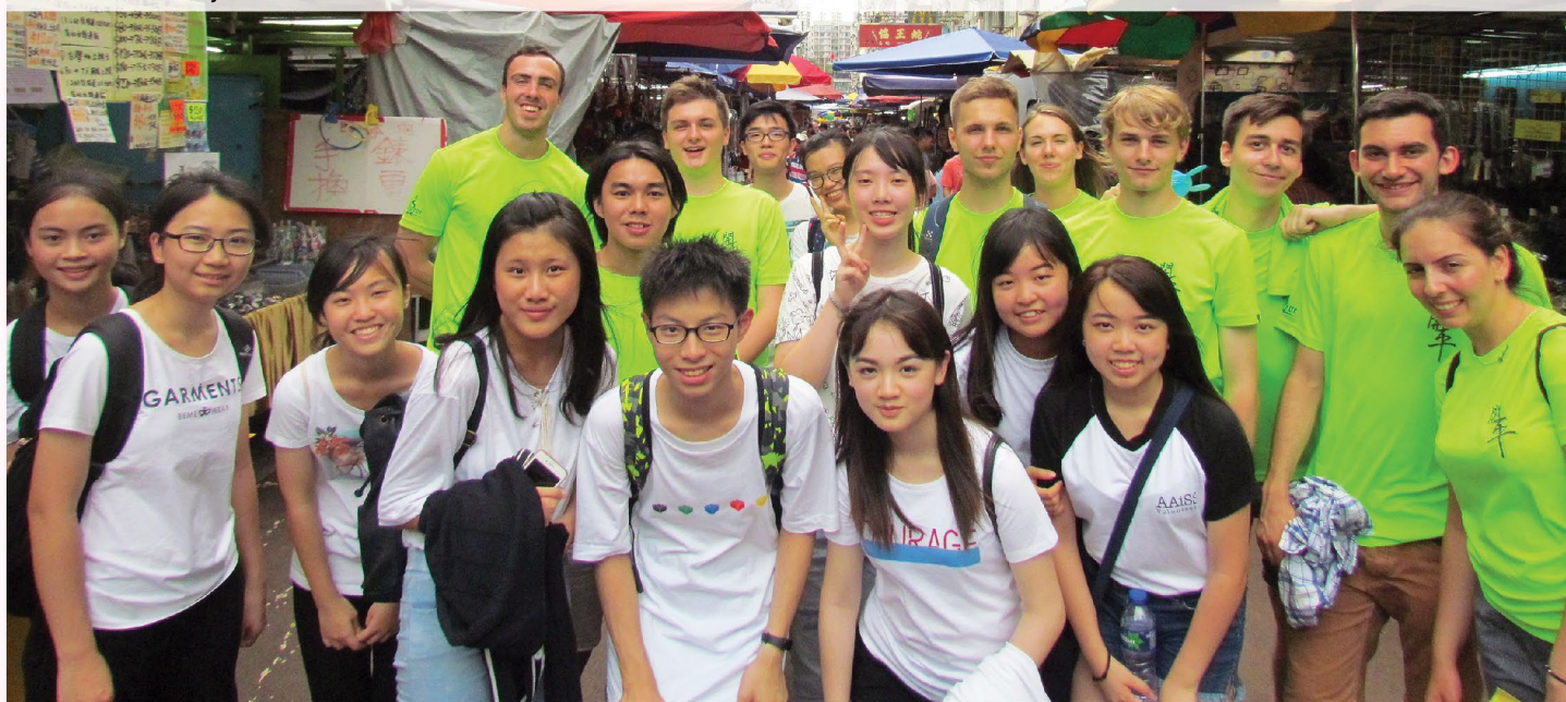
Our 'tour guides' introduced the history of Apliu Street to students from the University of Edinburgh.

Eleven S4 and S5 students took the initiatives and acted as tour guides to the ten student visitors from the University of Edinburgh. The visitors were brought to numerous famous tourist spots like Wong Tai Sin Temple, Apliu Street, Mei Ho House and Garden Hill. Not only did students enhance their career-related knowledge, but they also had their horizons broadened through the cultural and academic exchange with the visitors. All of them had an enjoyable and fruitful day.